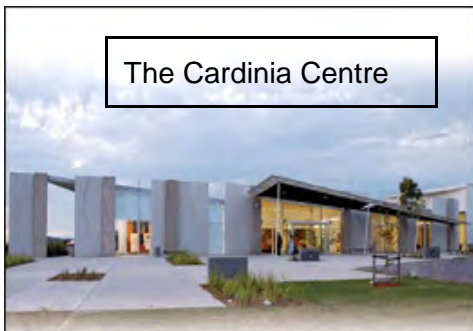
The Cardinia Centre

The quarter started with a concert at the Cardinia Concert Centre on April 17 th .