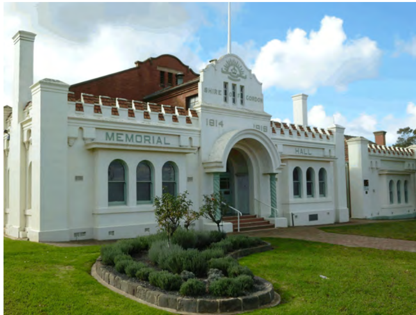
Boort Memorial Hall - Historic Venue for a recent concert