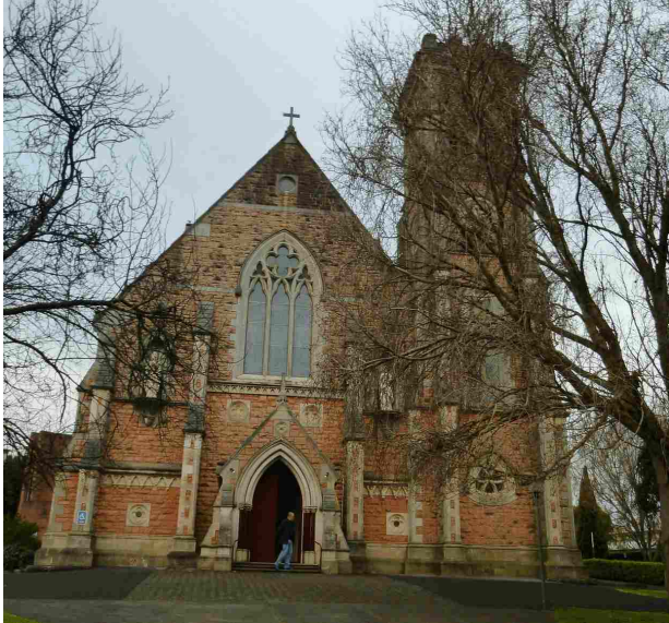
St. Paul's Mount Gambier