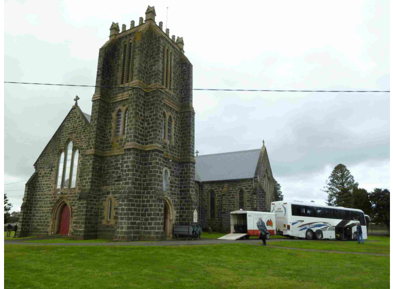
St. John's Port Fairy